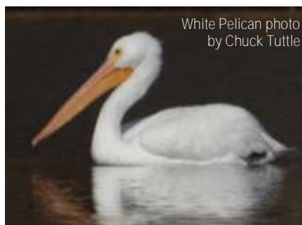
White Pelican