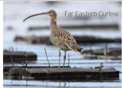
Far Eastern Curlew

sible, another option is to try to build artificial sites. This can involve a significant amount of construction and possibly alter coastal ecology.