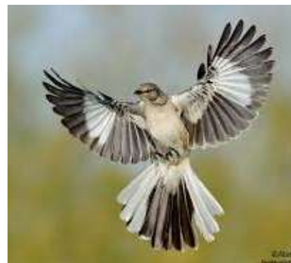
Northern Mockingbird: one of the potential species missed on last year's Lafayette CBC

Ed Hopkins 765-463-5927 birder4in@gmail.com